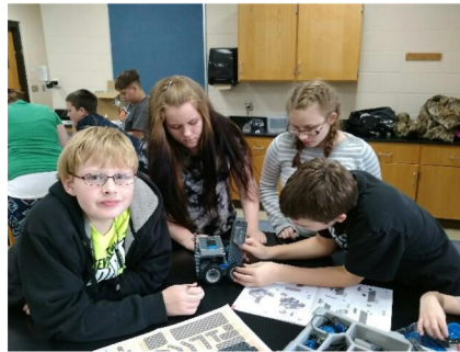
The 4-H After-School Robotics Club in Iosco County received a $1,000 Michigan 4-H Legacy Grant to use VEX Robotics as a tool to help club members develop life skills.

Learn more or apply online at http://mi4hfdtn.org/grants . Questions? Contact the Michigan 4-H Foundation at 517-353-6692.